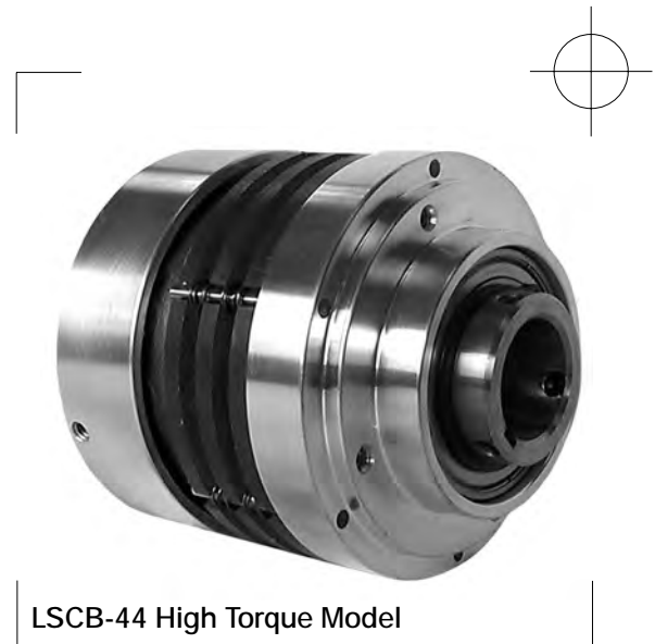
LSCB-44 High Torque Model

Mounted on the roller shaft of an accumulating conveyor, LSCB-44HT clutch-brakes provide positive stopping and holding. Nexen's splined hub design assures full brake torque to the system. Both clutching and braking components utilize the same piston to eliminate simultaneous engagement. Because the clutch release springs also serve as the brake engagement force, the brake automatically engages as the clutch releases for fast, dependable stopping and holding. With simple design, high torque and low cost, the LSCB-44HT is the obvious choice for motion control on material handling conveyor systems.